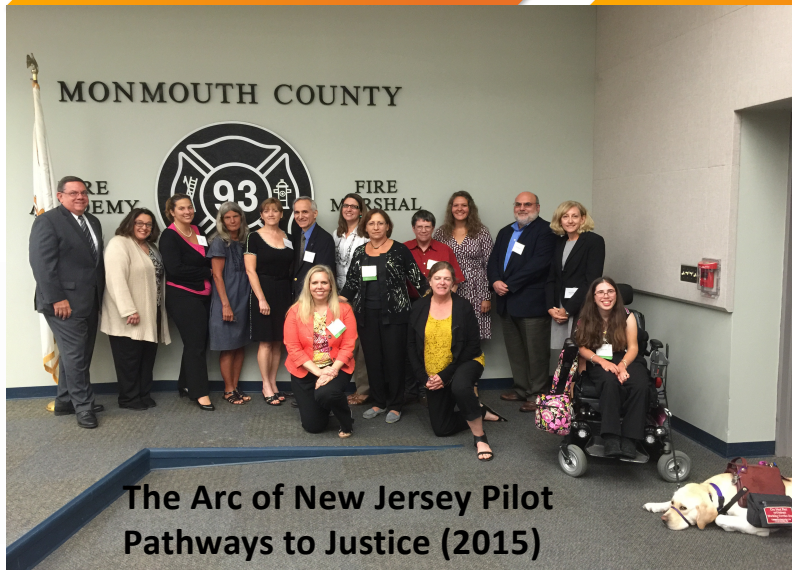
The Arc of New Jersey Pilot Pathways to Justice (2015)